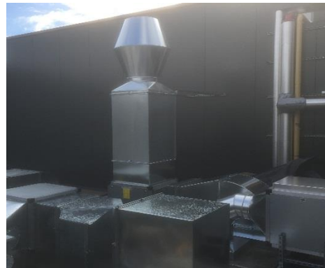
Kitchen Extract Discharge